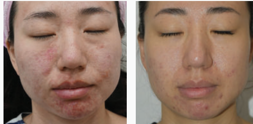
Before and after 3 treatments